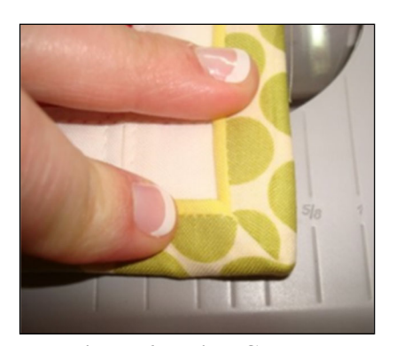
Figure 6 – Miter Corners