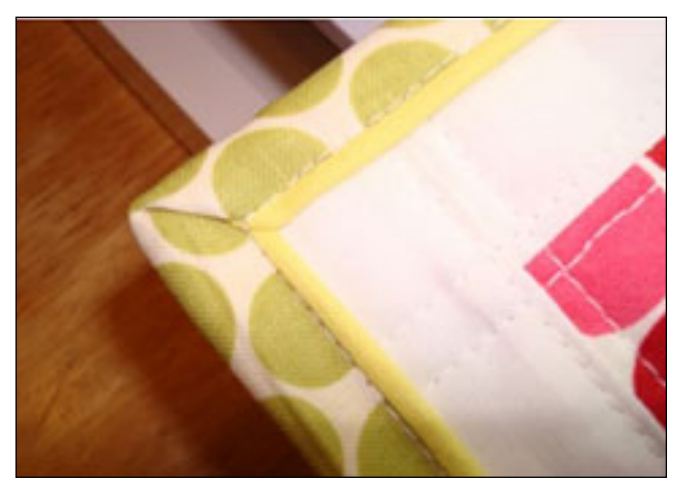
Figure 1. Finished Faux Piped Biding

It is a great technique when you want to do all of the binding by machine using only a straight stitch. Faux piped binding adds a tiny pop of contrast between the binding and the quilt top, Figure 1 .