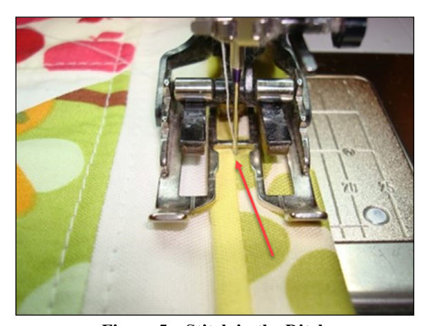
Figure 5 – Stitch in the Ditch

Or stitch to the right of the ditch on the binding fabric (1-2 needle positions to the right of the ditch), leaving the accent fabric to peak out with a loose edge.