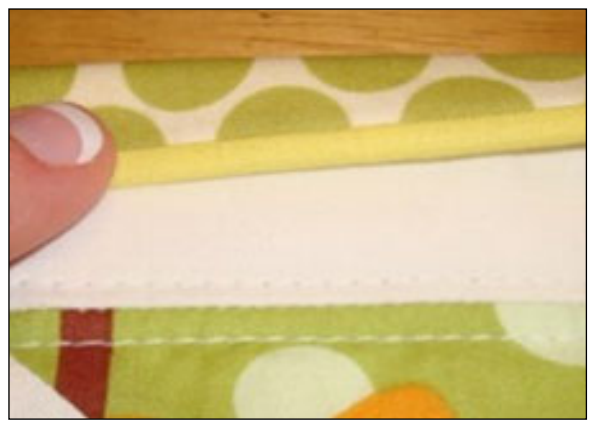
Figure 4. Turn binding to quilt front