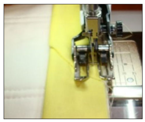
Figure 3 - Stitch binding to back

Join strips and sew the ends being careful to align the two fabrics accurately.